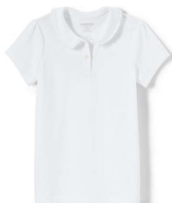
For chapel day and special occasions