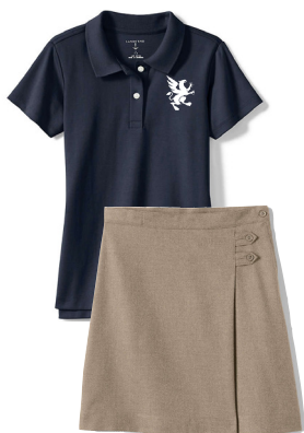
Daily uniform options