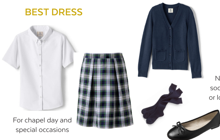
For chapel day and special occasions

Navy tights or socks, Black flats or low heels (2" or lower)