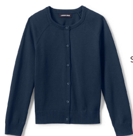
Navy cardigan sweater (optional)