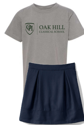
Field Trip uniform